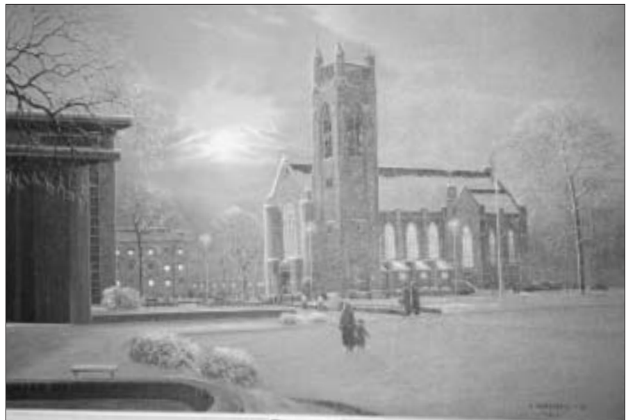
Charles Summey's painting depicts the Williams Memorial Chapel aglow with warm light on a snowy winter evening.

The 500 unframed limited edition prints will be available in July. Image size will be approximately 16" X 24". To reserve your print, please complete the information on page 8. All net proceeds will be applied to the Alumni Chapel Restoration Fund.